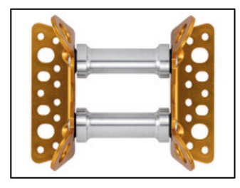
Multiple connection holes allow for choice of mounting options: 10 or 12 mm bolts, PULSE, COEUR PULSE